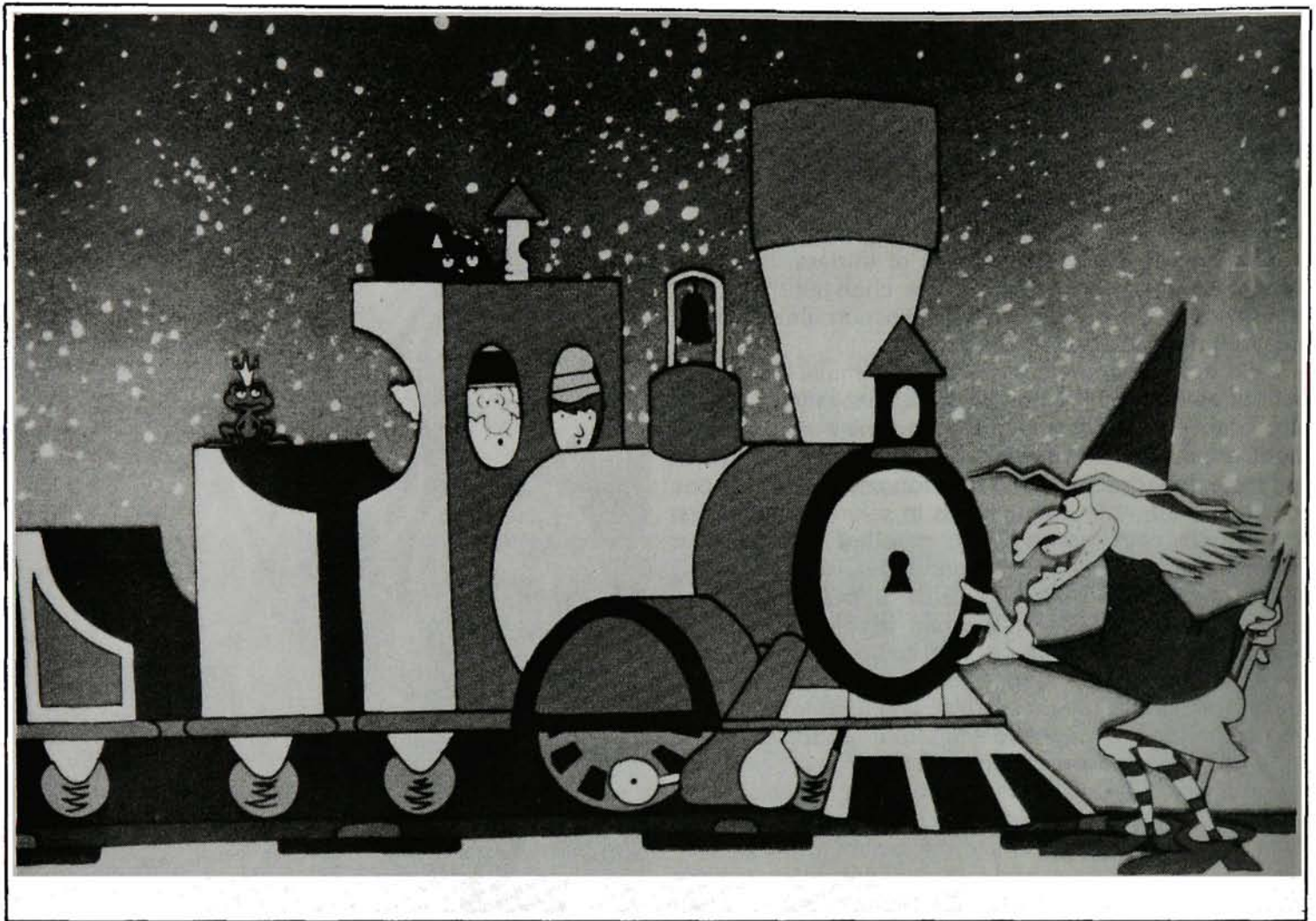
Les voyages de Tortillard (The Secret Railroad) is breaking new ground in the field of animated films for children

right at the beginning. Once you are a month behind schedule, it is too late — everything becomes disorganized. With the first series, we did not know where to anticipate delays. In live action, I knew how to minimize the effects of a delay, by working on other aspects of the production. I worked in make-up, accessories, and costumes, and could use the time constructively. But when an animator was delayed, I was at a loss to find a solution. Unlike the director who is too involved artistically in what he is doing, it is the producer who has the time and distance who must find solutions to delays."