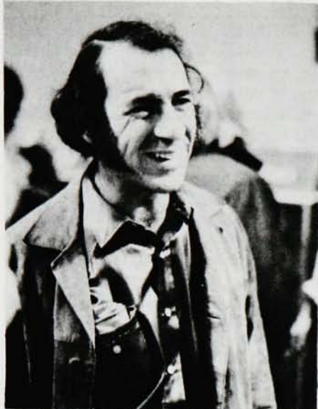
"There is no way to join my organization — you just have to be one."