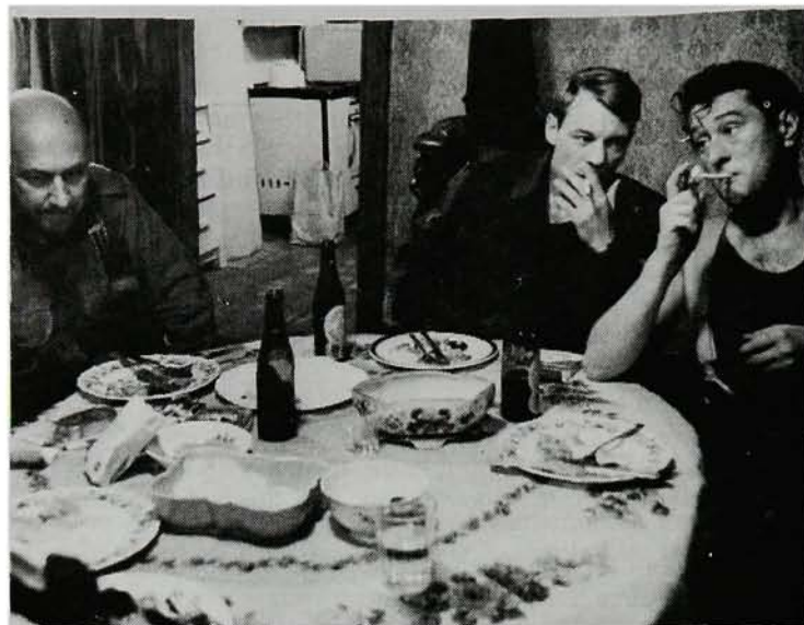
The beery two-some, home from the army, in Wedding in White

Death Weekend shares frighteningly similar characteristics with its predecessor. In crudest terms, we find in both films rape, a group of drunken men who terrorize women, and women as victims of men's mental frustrations and sexual needs. Diane fights back, as Jeannie never did. Paradoxically it is she who is really responsible for the holocaust of violence precisely by doing this. Her aggressive 'masculine' driving is skillful enough to push Lep and his gang off the road at the beginning of the film. It is her abili-