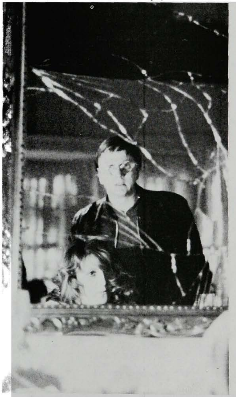
A razor-cut as foreplay in Death Weekend