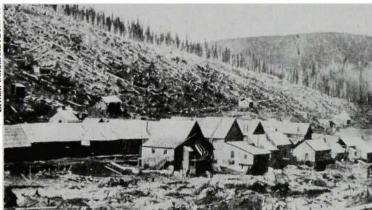
Carving out Richfield, a miners' town in B.C.

Then I thought well, why not show what the Canadian film industry has so far NOT done. Show some of the Canadian stories and themes which I, myself, have incorporated into scripts which have been ignored completely by every possible arm of the Canadian film community. For in this list of rejects lies something that ought to be said about the state of Canadian filmmaking.