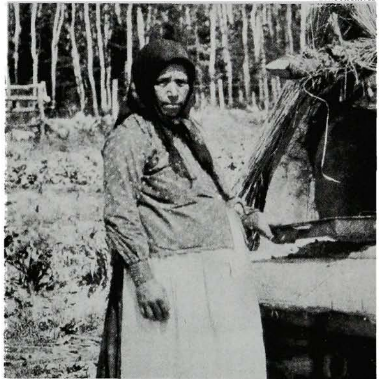
Baking bread wasn't always easy for the women