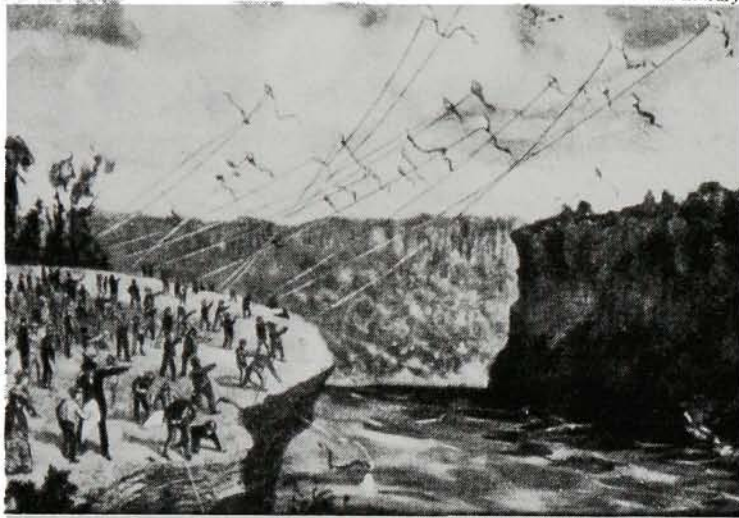
And how about flying a kite across the Niagara gorge to build a suspension bridge?