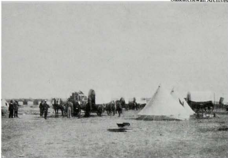
English colonists stop at Saskatoon