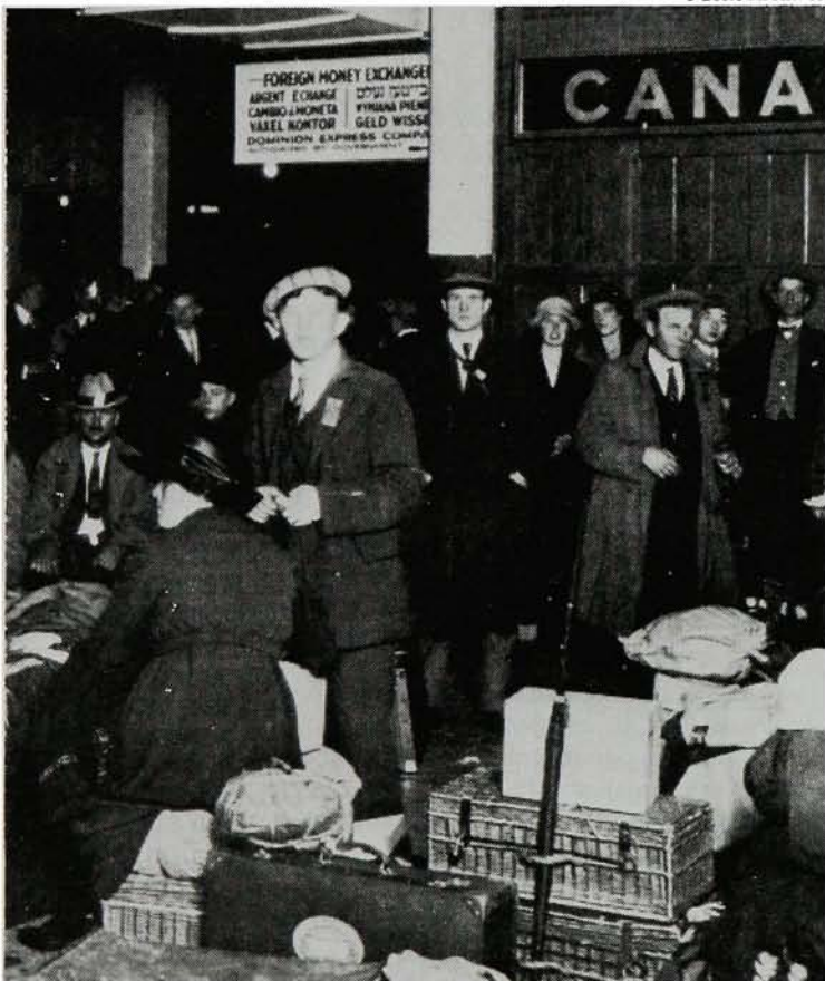
Ellis Island didn't corner the market on immigrants

monds had less faith than he has I would despair, but he doesn't and I won't and one day we will get this very good story filmed.