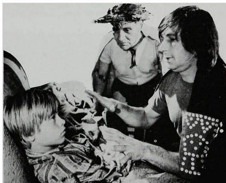
Dreamspeaker by Claude Jutra: a shaman and mute friend nurse a small boy with love