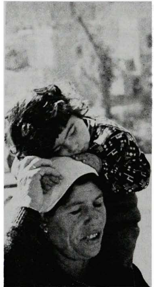
A scene from The Arab Jews