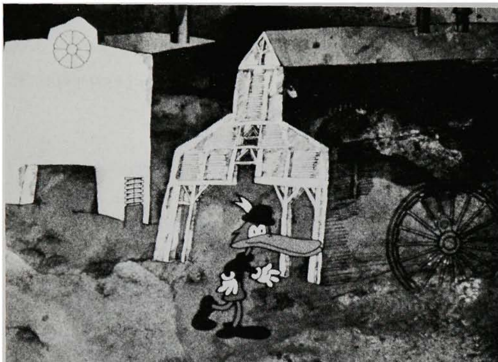
A Quiet Day by Al Sens

storyline and character development. I'm predominantly a visual animator. I'm excited by abstract design and geometric shapes; the conceptual and experimental aspects of film.