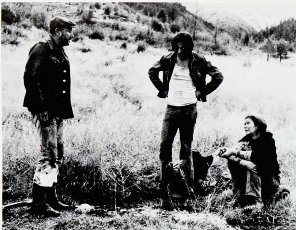
Donald Pleasence, Don Calfa, and Kate Reid in "The Rainbow Boys."

bush, riding his unusual, three-wheeled motorcycle all the way from "the Big Apple." Conveniently, he's looking for a gold mine. The sorry-looking trio takes off for the mountains on the motorized tricycle, and the result is a truly human, warm, touching, and at times very funny motion picture, which should do well at the box-office. The acting is excellent throughout, the dialogue is reminiscent of Harold Pinter's work, and the B.C. scenery is breathtaking. With a bit more imaginative camera-work and a less conventional, cumbersome musical score, The Rainbow Boys could be a perfect film. As is, it's still an off-beat, Canadian gem of a movie.