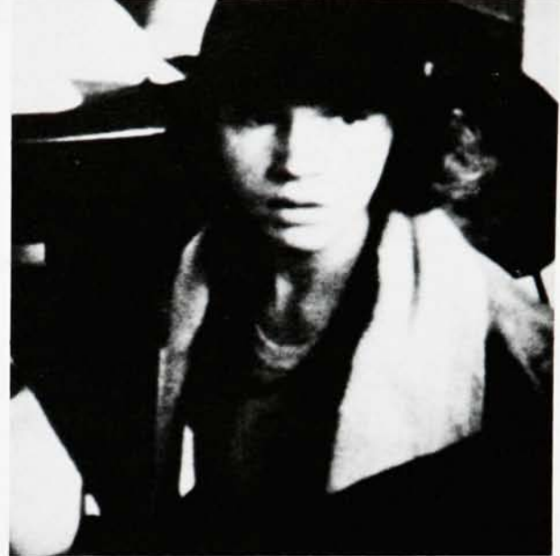
"Come on Children"

parents come to visit and the proverbial gap between the generations yawns as wide as the screen. Up until then, the film introduces and attempts to make multi-dimensional the ten protagonists, with a youthful sense of chaos. But filming visiting day, which was also 'set up' but is a natural event, King seems to revert back from filmmaker to schoolteacher, and decides to present the other side. He does it with such an air of candid repression, that we all have a sigh of relief with the kids after mum and dad have left and welcome their immediate reaction as the cars pull away — "Let's get stoned."