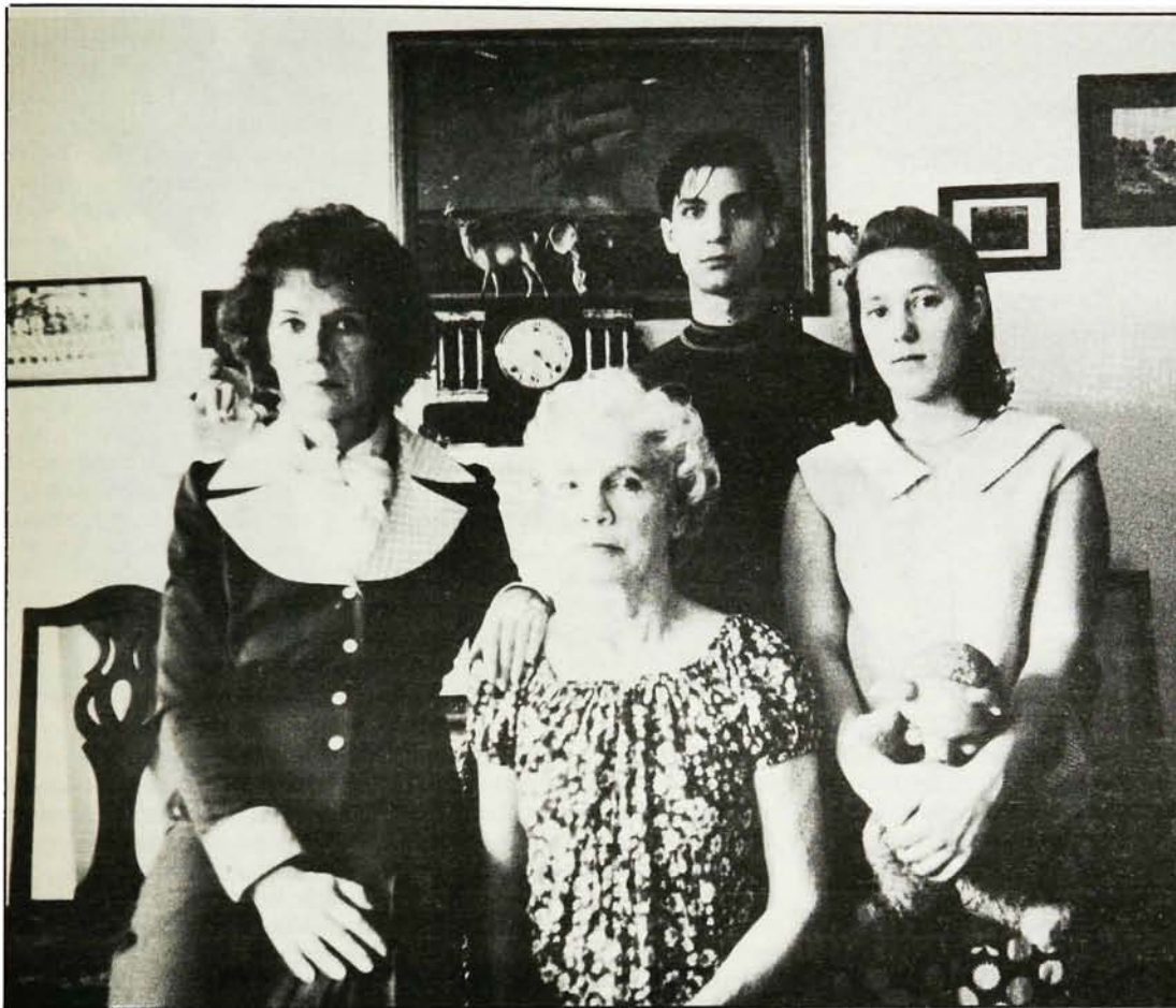
Delta Dusk, by Stev'nn Hall

What should be the role of the film school? I would suggest that these institutions teach students how to perform higher acts of experimental subversion. To give them all the technical training, equipment and money necessary to define their own visions. To let them loose on the world without having to pass their scripts through the filters and levels of prior