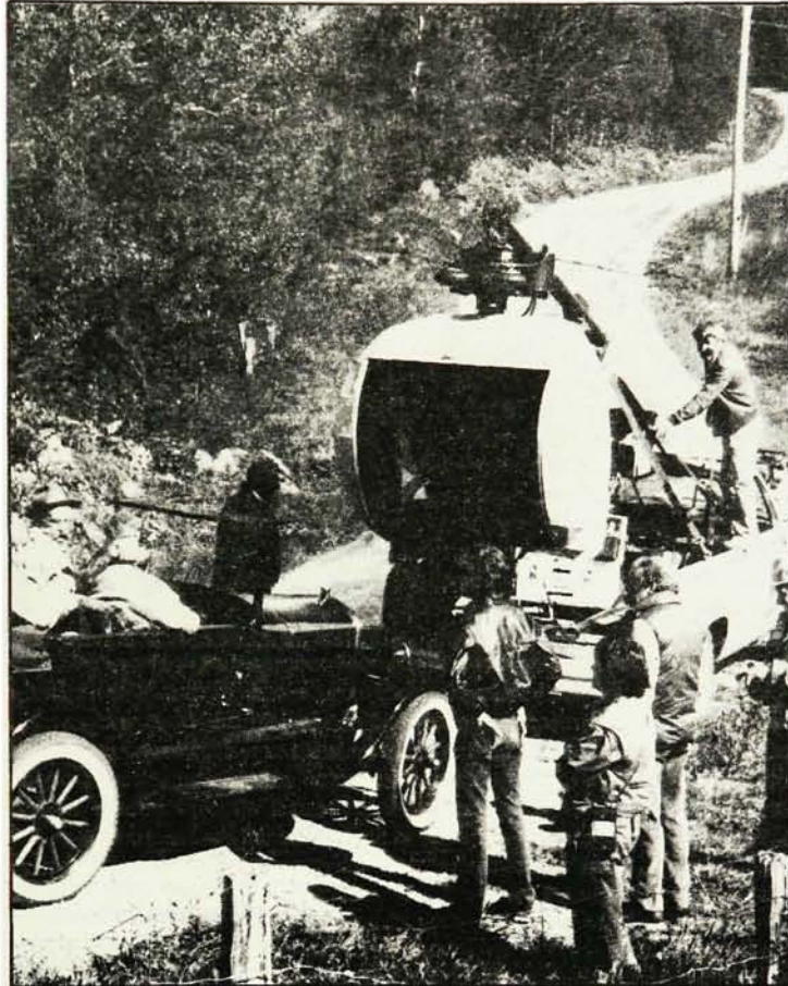
Shooting Transitions , Colin Low's 3-D IMAX film for the NFB

The film industry is not the only one exploring