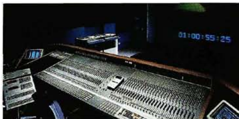
Theater 1 – Digital Feature Mixing

to accommodate all mixing formats. A Master's specialty – complete Digital sound for IMAX/OMNIMAX and SHOWSCAN.