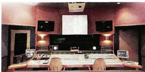
Theater 3 – TV and Music Mix

Ah, progress. What a truly masterful idea.