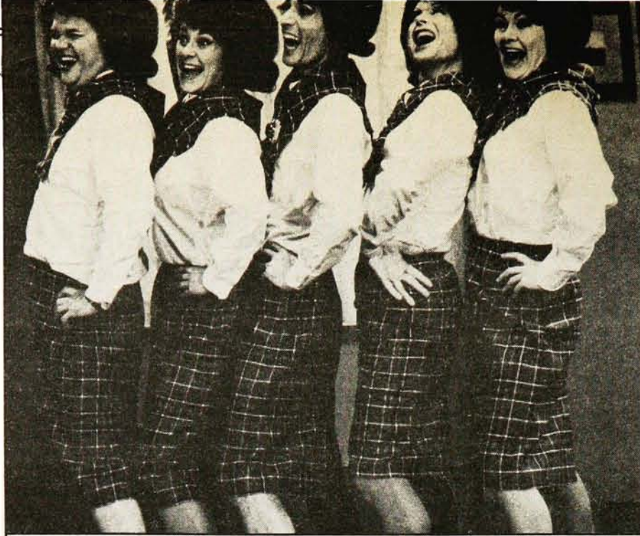
• Andy Jones, Cathy Jones, Greg Malore, Tommy Sexton and Mary Walsh in Codco

One of the most interesting aspects of this production is how it was put together and what it may represent in