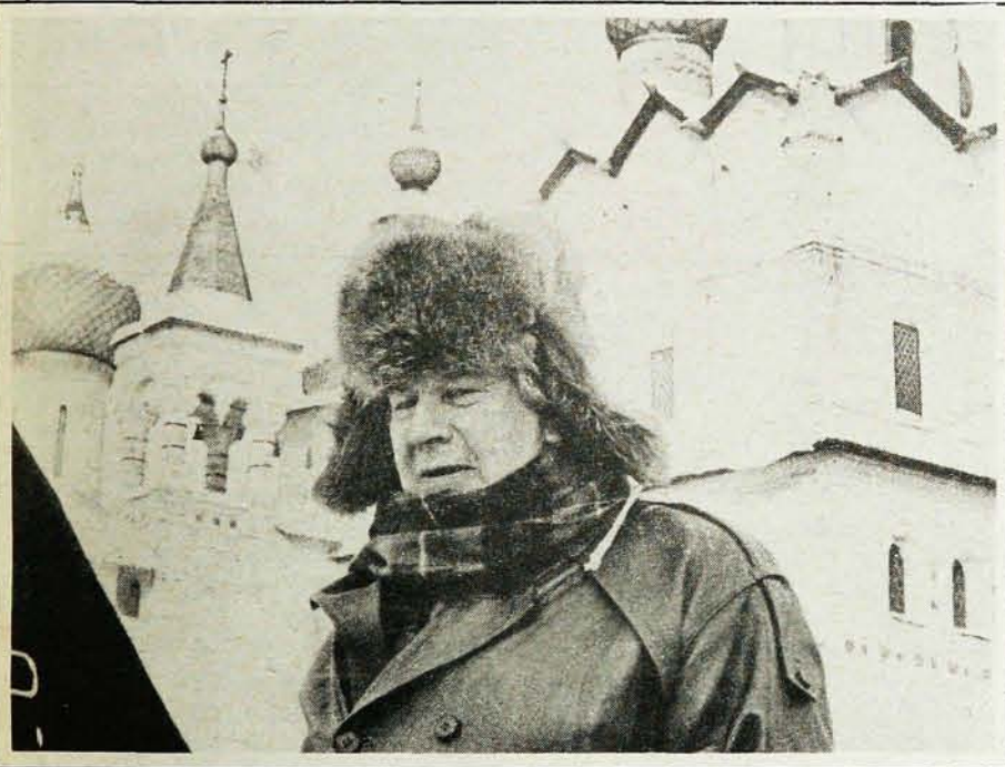
• In the city of Rostov