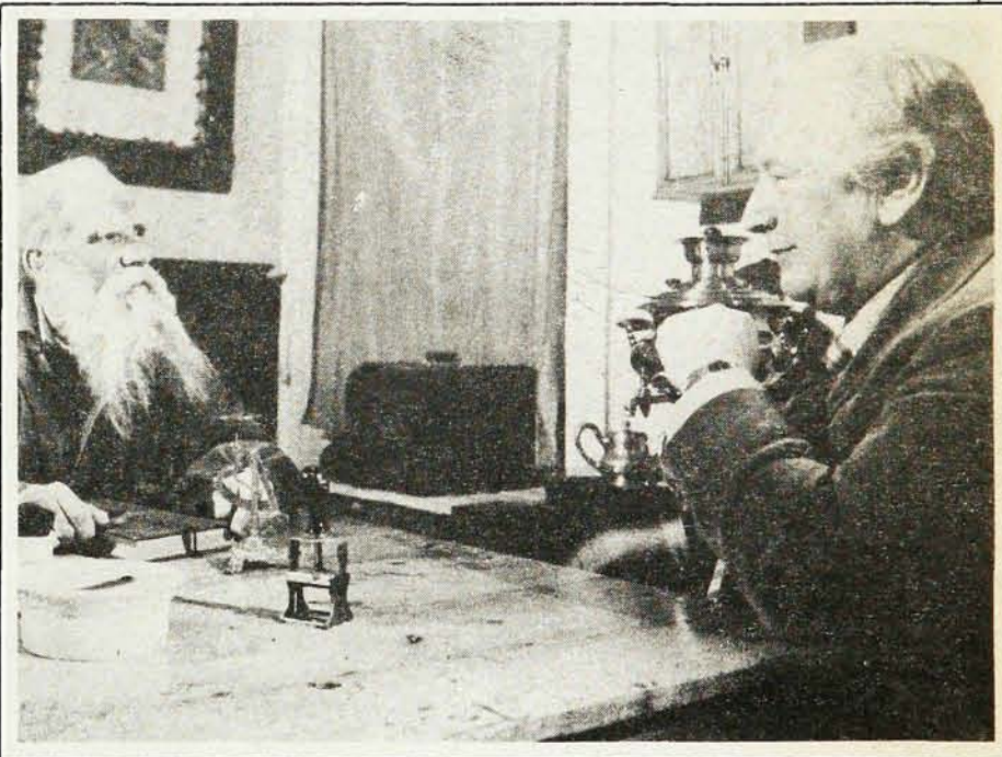
• Visiting Lev Tolstoy (Lev Durov) at Yasnaya Polyana