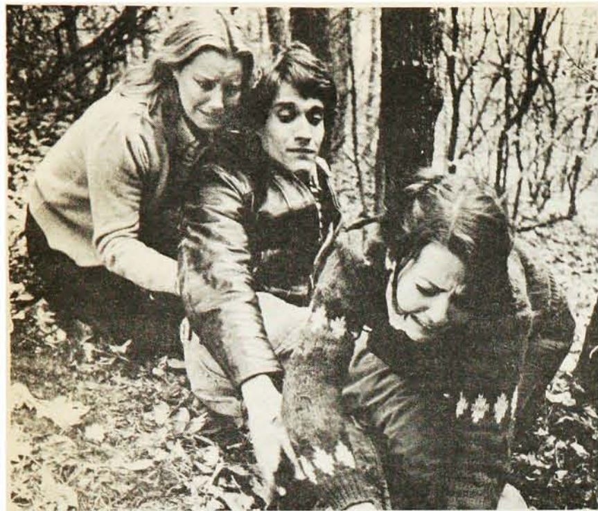
• The Killer Instinct: doomed by fake Dixie accents