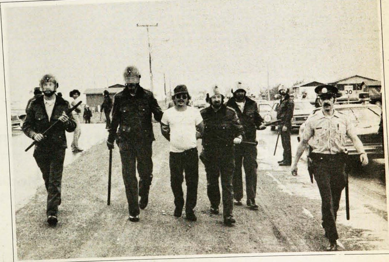
• Alanis Obomsawin's Incident At Restigouche

they are usually edited down to fragments. While authority figures are treated with great respect whether they deserve it or not (except in some good investigative reports) people without power or "expertise" are not granted much credibility. Whenever social criticism is expressed, it's well within "reasonable" limits.