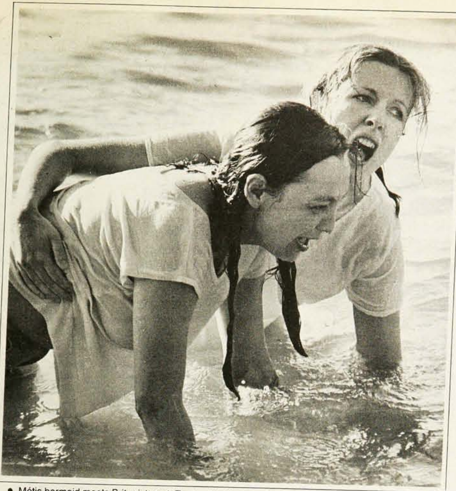
• Métis barmaid meets Brit aristocrat: Tantoo Cardinal and Susan Wooldridge in Loyalties