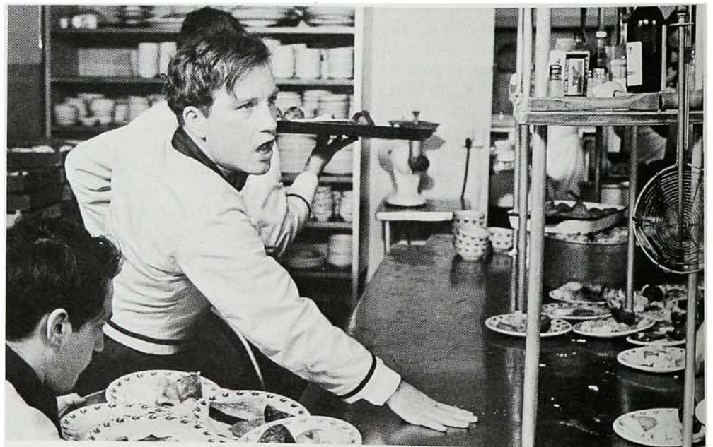
Richard Dreyfuss, star of The Apprenticeship of Duddy Kravitz