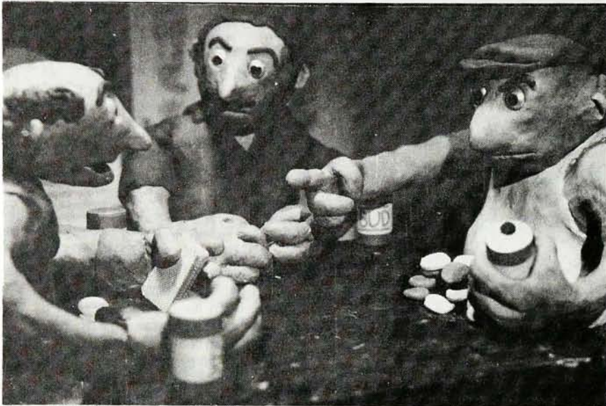
Fine and Mann's larger-than-life characters playing poker in The Only Game In Town — certainly the only one with Plasticine puppets