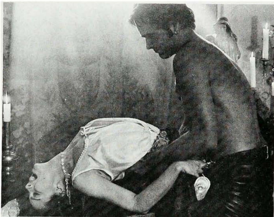
Jennifer Dale and Winston Rekert in Your Ticket is No Longer Valid ...Keally?

Daley then adds, though, "I jumped on her bones three times last night." Maryvonne is caught off guard but, composing