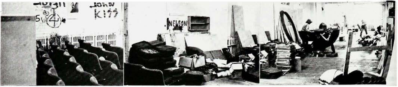
The "new" Funnel under construction