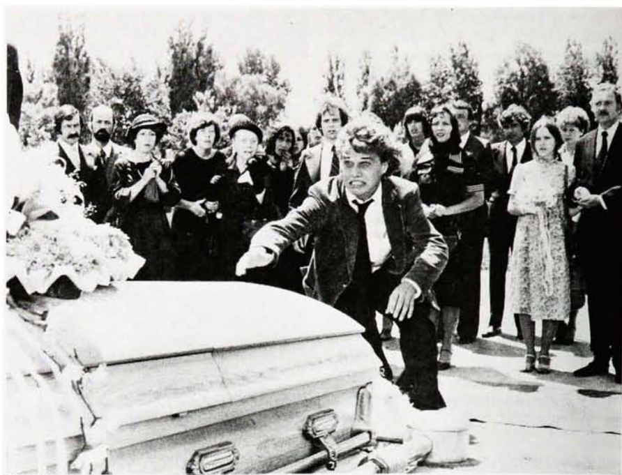
It's all in the family in BLOOD RELATIVES

Chabrol, as usual, has created a wonderfully moody piece. The dank streets of Old Montreal are properly eerie and the feeling of gloom and doom is nicely captured by Jean Rabier's camera. Rabier is to Chabrol what Sven Nykvist is to Bergman: both make a perfect team. But in Blood Relatives the timing is off. Rabier sets the shot, but Chabrol fails to follow through with the volley. Atmosphere is everything to Chabrol but it doesn't add-up to a thrill.