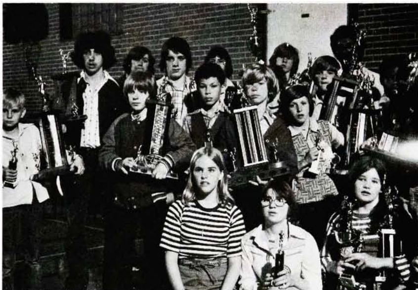
The kids from the Point: sometimes winners.