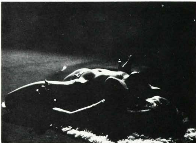
Scenes from "125 Rooms of Comfort"