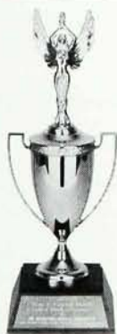
WINNER IFPA AWARD The CINDY Award Alan Gordon Award for Technical Achievement 1973 Informational Film Producers of America, Inc. 14th Annual Cindy Awards Banquet

INTERNATIONAL STANDARD OF THE INDUSTRY FOR OVER FIFTY YEARS. More film footage goes through Moviolas in one year than through all other makes combined in the entire history of film-making. Once you've worked with a Moviola, the reasons why become obvious.