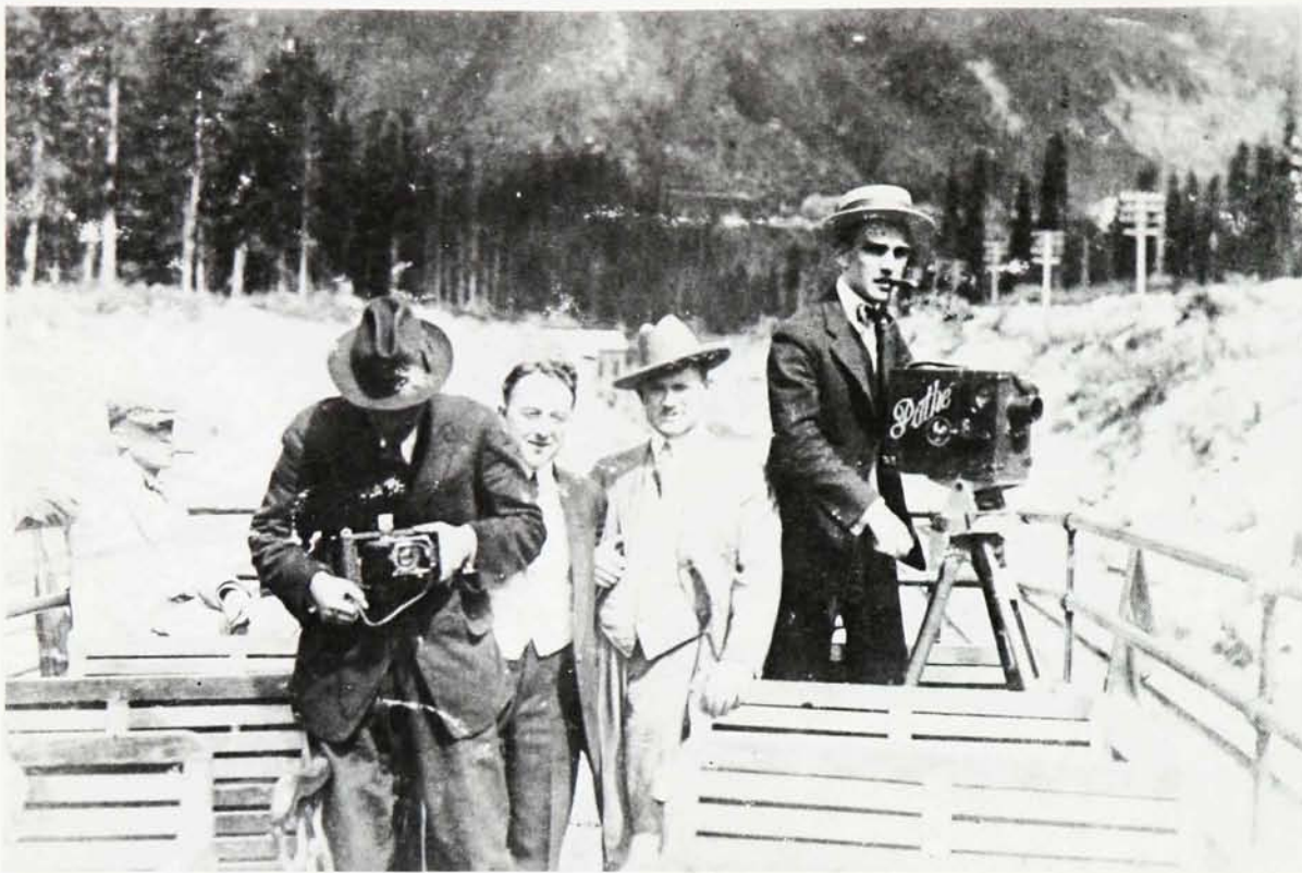
Ernest Ouimet (centre in hat) – one of Canada's Film Pioneers