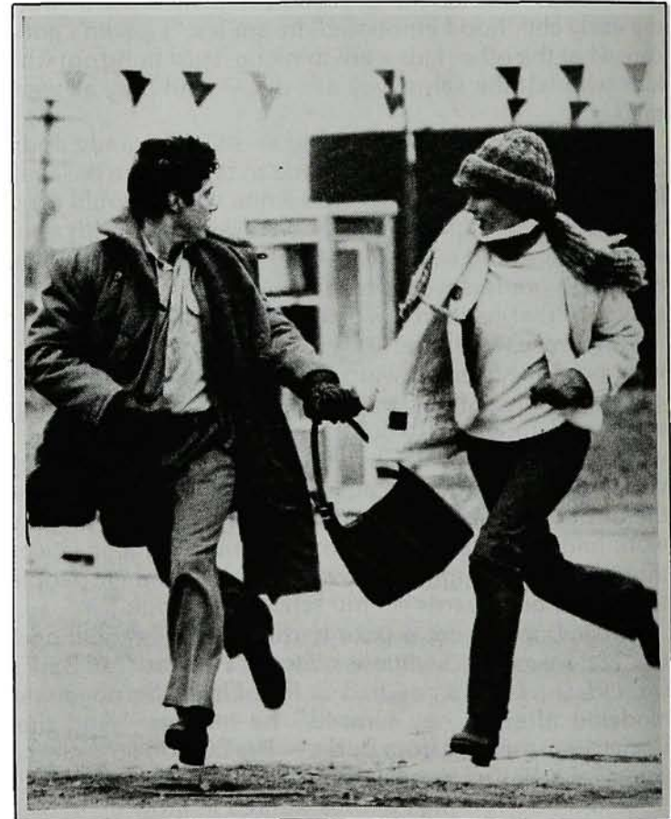
Every second counts for Lack and O'Neill as they make a run for it in Scanners .