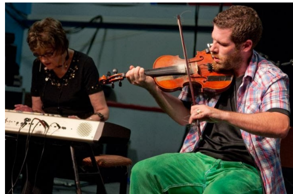
Figure 2: Maybelle performing with Ashley MacIsaac.

MCM: That's exactly what I've been doing. When you're improvising, you don't want to be repetitious. You want to vary it. There are various ways to do it. I can't explain it.