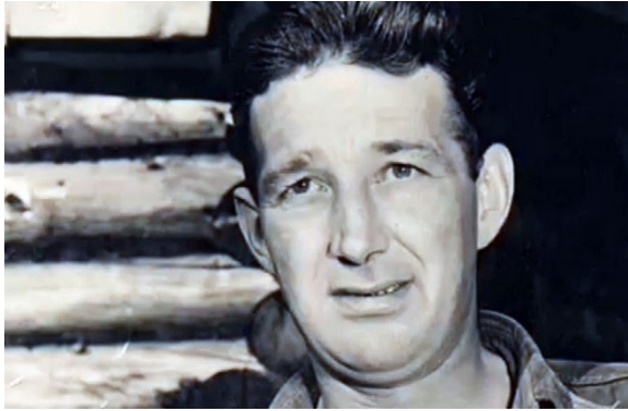
Figure 2: Wilbert Coffin.

not only from text and melody but also from the specific presentation of that story through the song's form. In these instances, the ways in which a story is told are arguably as important as the story's basic themes" (2007: 42). I conclude with some reflections on the relationship between these songs, the archives I established with Vision Gaspé-Percé Now, and the presence of this story in the collective memory of the English-speaking population of the eastern Gaspé Coast.