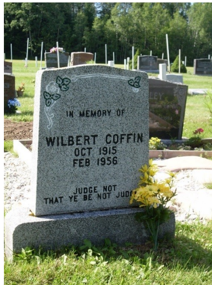
Figure 3: Wilbert Coffin's headstone. The obscured inscription reads: “Judge not that ye be not judged.” (July 2011).